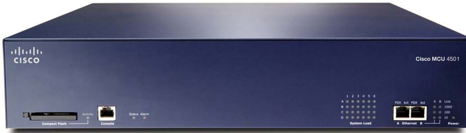
Figure 1. Cisco TelePresence MCU 4501